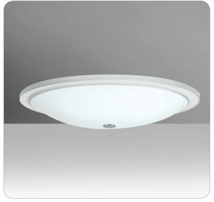
MANTA CEILING SHOWN IN OPAL GLOSSY

UL or ETL Listed. Suitable for Damp Locations (interior use only).